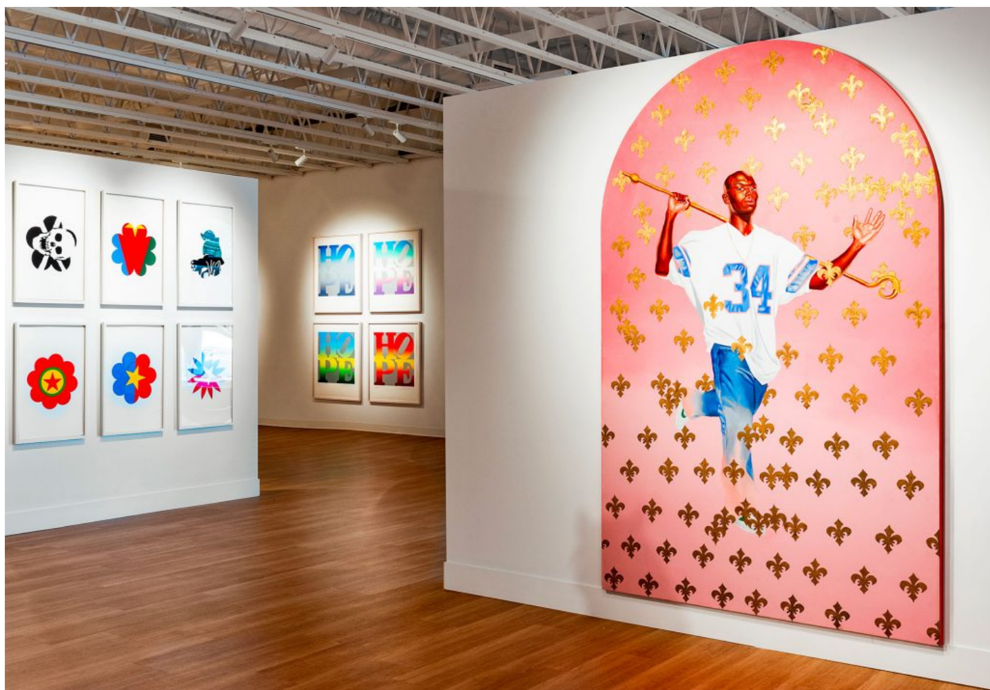
Installation view of "We Are The Revolution," on view at the Schnitzer Collection in Portland, Oregon, through December 1, 2023.